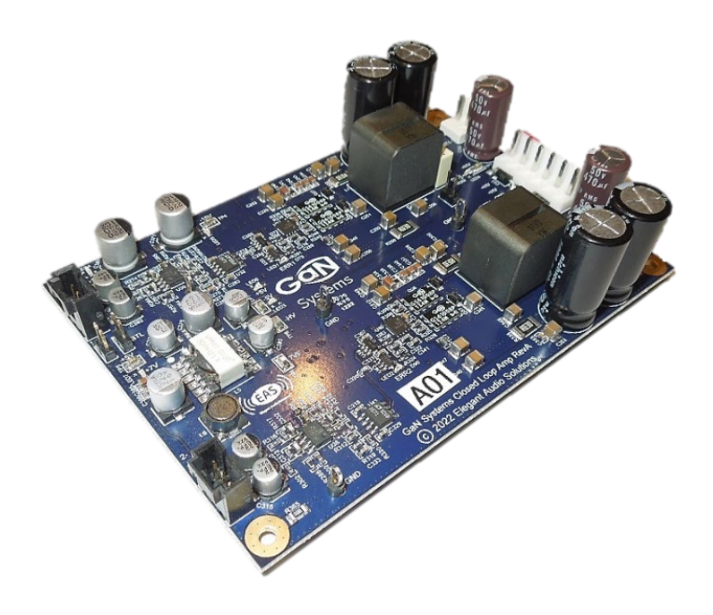
Figure 1 GS-EVM-AUD-AMPCL1-GS Evaluation Module