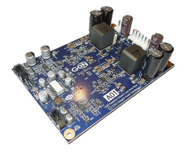
Figure 4 GS-EVM-AUD-AMPCL1-GS