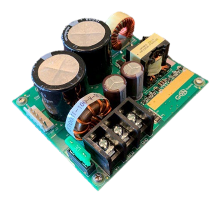
Figure 1 GS-EVB-AUD-BOOST-GS Evaluation Board