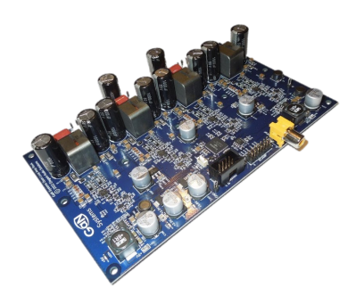
Figure 3 GS-EVM-AUD-AMPOL1-GS